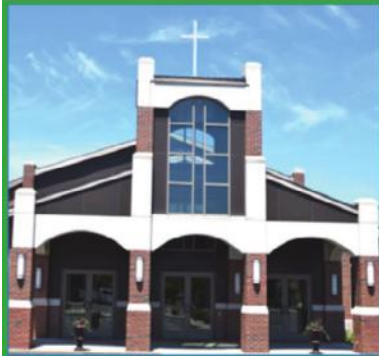
Saint Margaret Mary 3055 Leechburg Road Lower Burrell, PA 15068

Saturday ~ 4:00 p.m. Sunday ~ 8:30 & 11:00 a.m. Daily Mass: (Monday - Friday) 7:30 a.m.