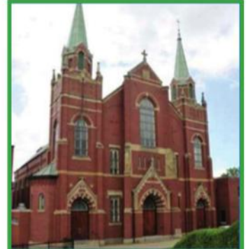
Saint Mary of Czestochowa 857 Kenneth Avenue New Kensington, PA 15068

Saturday ~ 4:00 p.m. Sunday ~ 9:30 a.m. Daily Mass: (Monday - Thursday) 12 noon (Friday) 8:30 a.m.