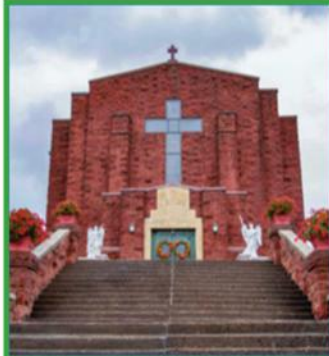
Mount Saint Peter 100 Freeport Road New Kensington, PA 15068

Saturday ~ 4:00 p.m. Sunday ~ 8:30 & 11:00 a.m. Daily Mass: (Monday - Friday) 7:30 a.m.