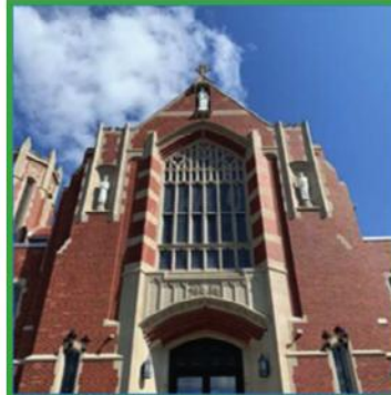
Saint Joseph 1125 Leishman Avenue New Kensington, PA 15068

Saturday ~ 4:30 p.m. Sunday ~ 8:30 & 10:30 a.m. Daily Mass: (Monday - Thursday) 8:30 a.m. (Friday) 12 noon