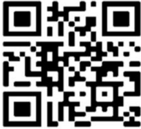
Mary Queen of Apostles, St. Joseph High School

Point and Click for Additional Information