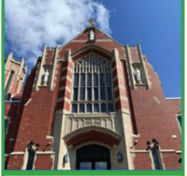
Saint Joseph 1125 Leishman Avenue New Kensington, PA 15068 Saturday ~ 4:00 p.m. Sunday ~ 9:30 a.m. Daily Mass: (Monday - Thursday) 12 noon (Friday) 8:30 a.m.