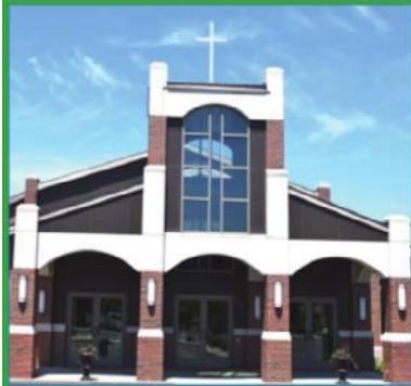
Saint Margaret Mary 3055 Leechburg Road Lower Burrell, PA 15068

Saturday ~ 4:00 p.m. Sunday ~ 8:30 & 11:00 a.m.