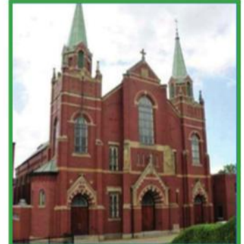
Saint Mary of Czestochowa 857 Kenneth Avenue New Kensington, PA 15068

Daily Mass: (Monday - Wednesday, Friday) 12:30 p.m.